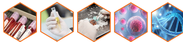
Blood Urine Tissue Cells DNA

Eurofins Viracor can also help with sample processing, extraction, aliquoting, storage, retrieval, transport, and final disposition, while retaining traceability and chain of custody.